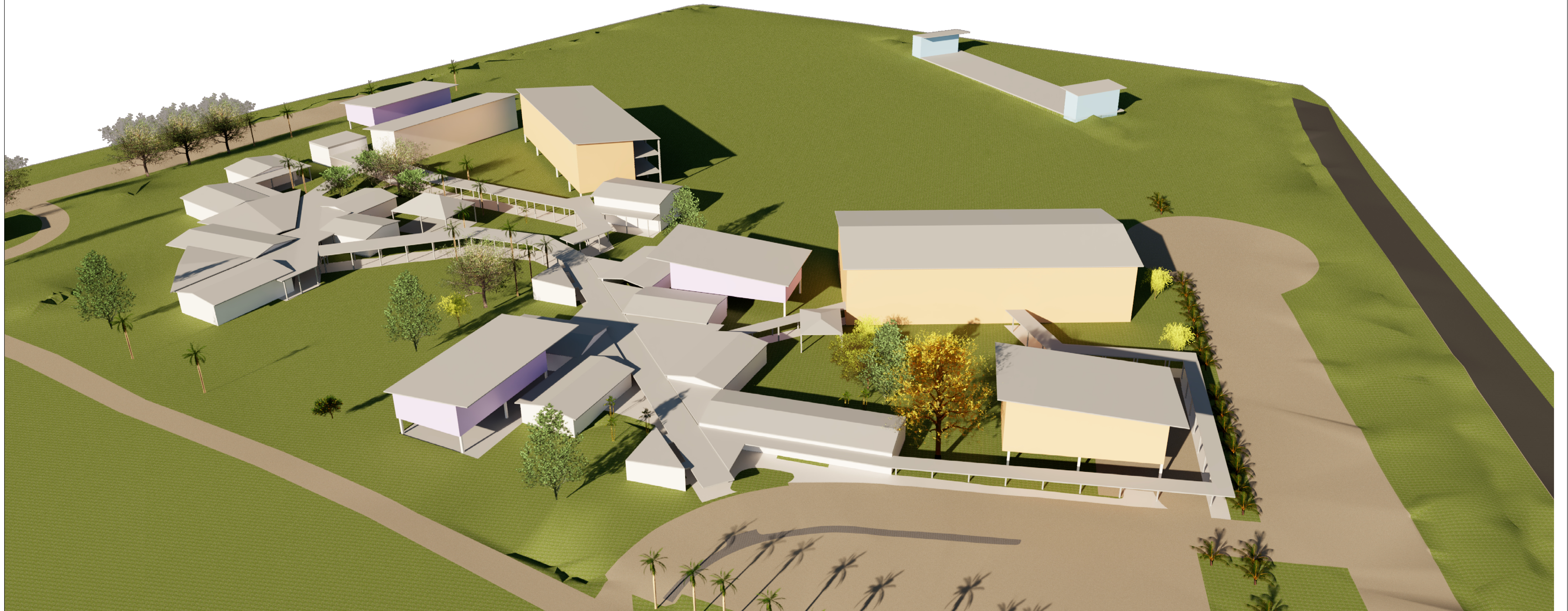
SITE OVERVIEW IMAGE